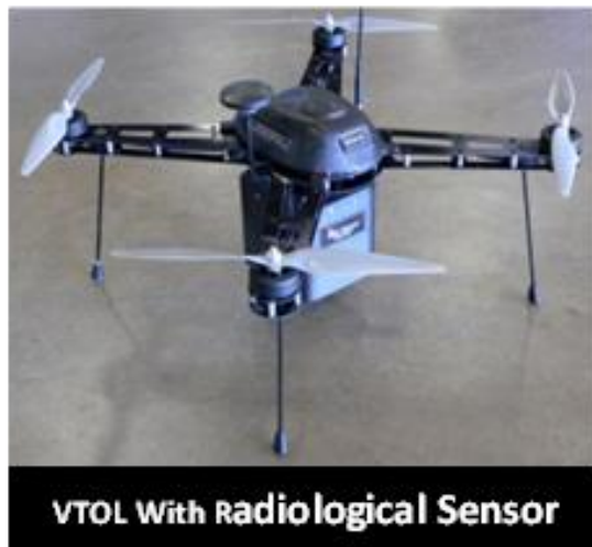
VTOL With Radiological Sensor