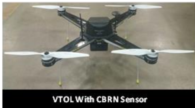
VTOL With CBRN Sensor