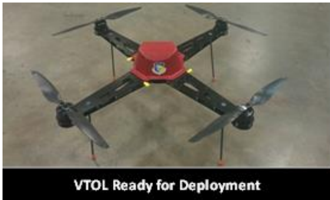
VTOL Ready for Deployment