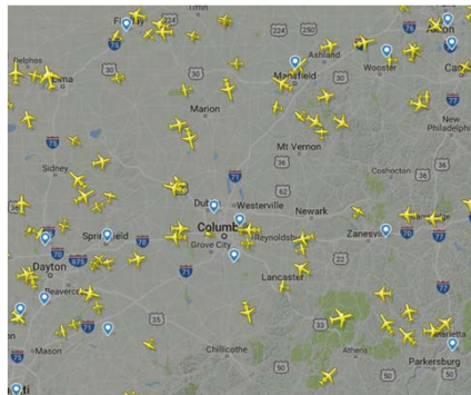
Columbus, Ohio CMH