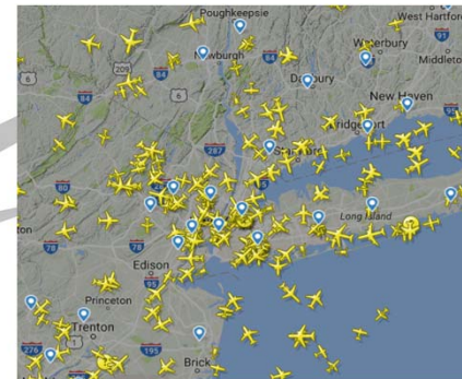
New York LGA