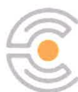
STUDENT Symbolizes the student we are aiming to reach