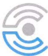
BOTTOM HAND SHAPE Symbolizes our essential network of educators