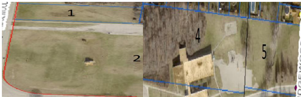
FIGURE 5 OPTIONS 2 AND 3

If that is not possible at a minimum, we would need parcels 1 and half of parcel 2 or parcels 4 and 5.