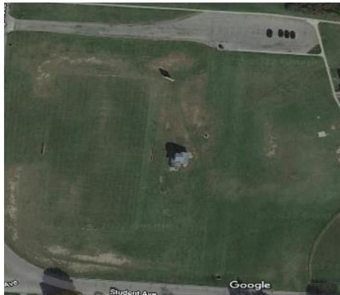
FIGURE 2 CURRENT FIELD

The current infrastructure used by Northridge Bearcats and Operation Beast is located on the west side of parcel number 2