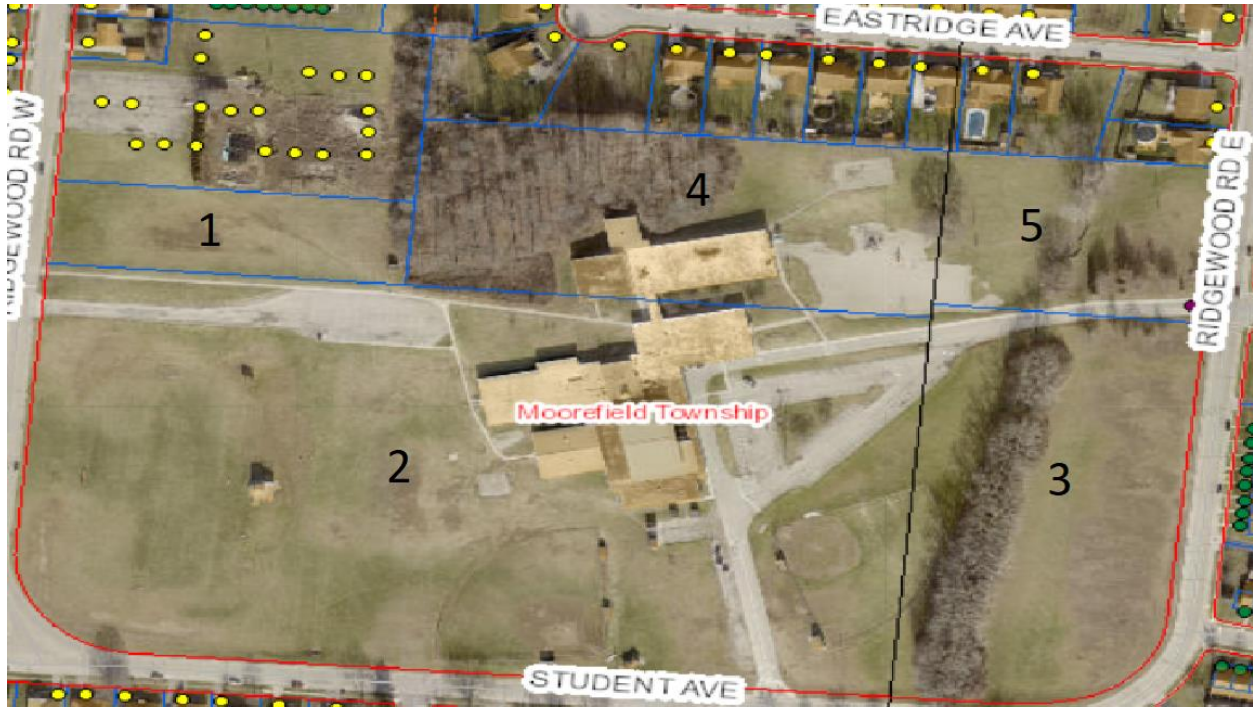
FIGURE 1 LAND PARCELS

We request the donation of land to use for Operation Beast. The development would include the facility, 5 new baseball/softball fields, a football field, outdoor basketball courts. The land is divided into 5 separate parcels.