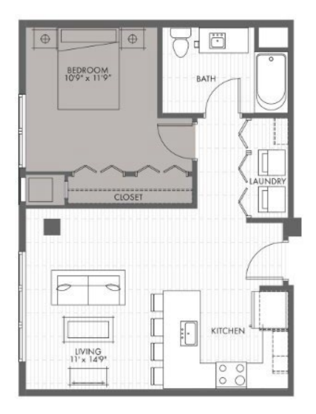
One Bedroom Apartment – Scheme 2