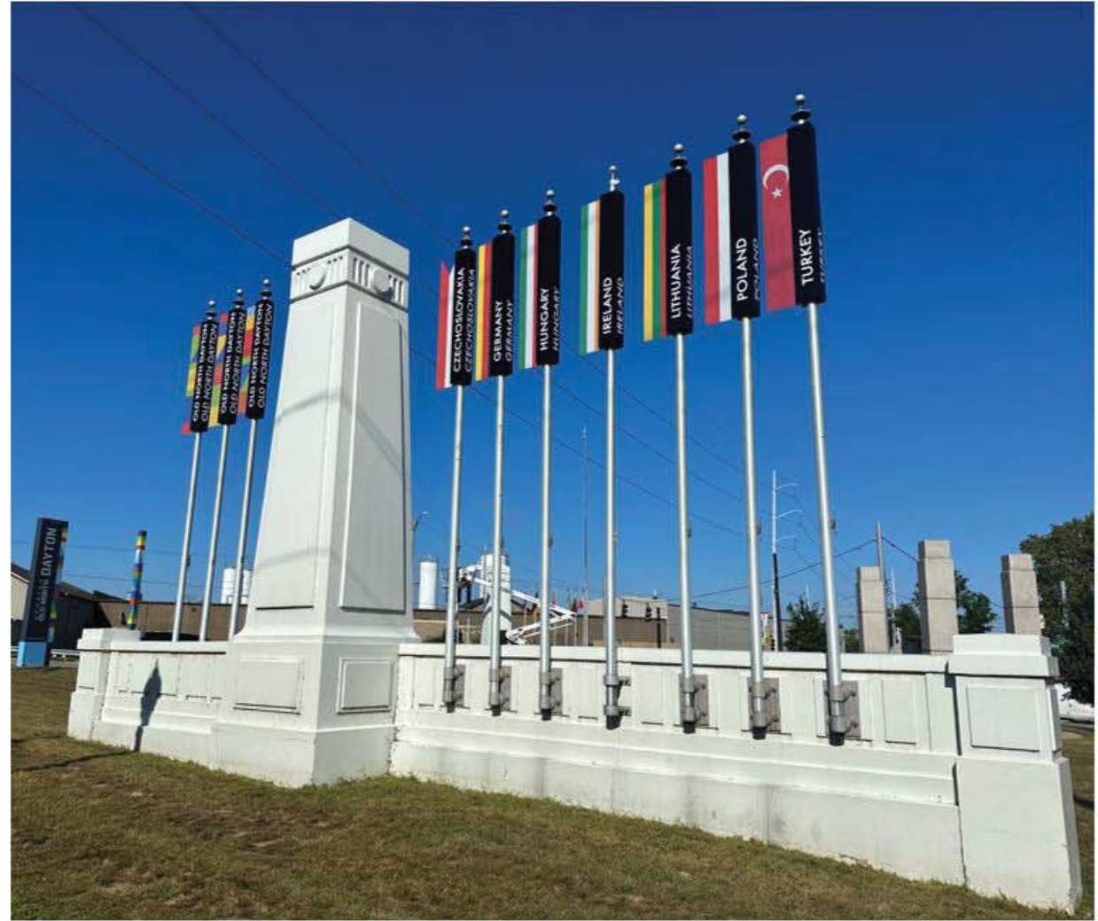
OLD NORTH DAYTON FLAG MONUMENTS